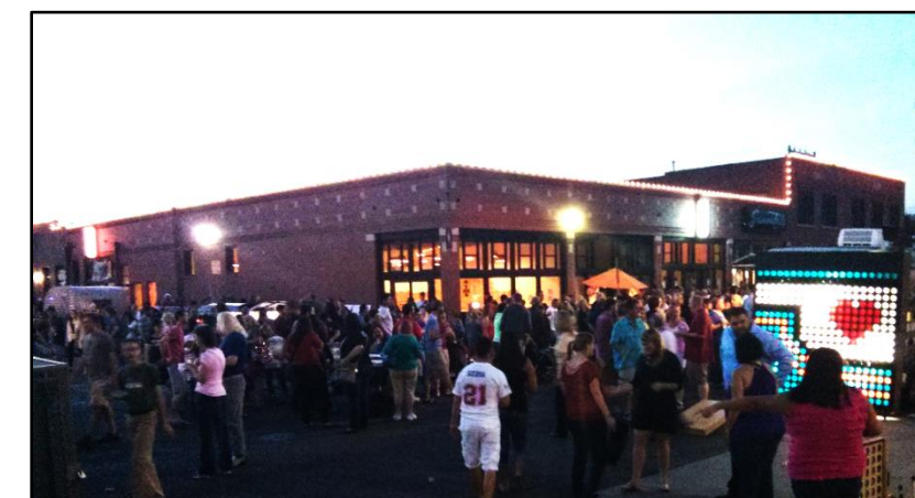
Food Truck Festival Attendees Visit Brick and Mortar Businesses