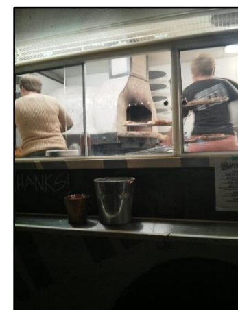
Wood Burning Pizza Oven