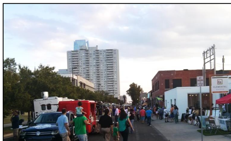
H&8 th , Billed as the 'Nation's Largest Food Truck Festival'