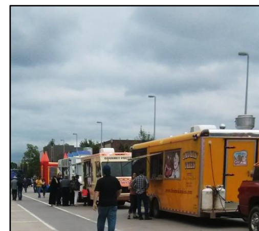
Trucks Lined up in the Film Row District