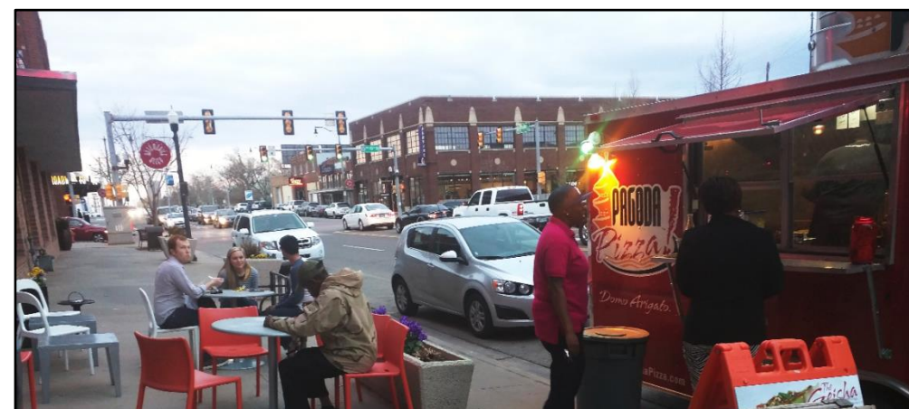
Food Truck and Street Furniture in Automobile Alley District