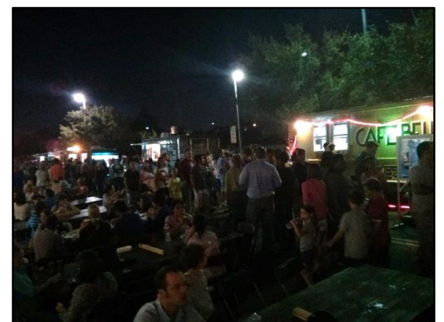
Lines and Tables at the H&8 th Festival