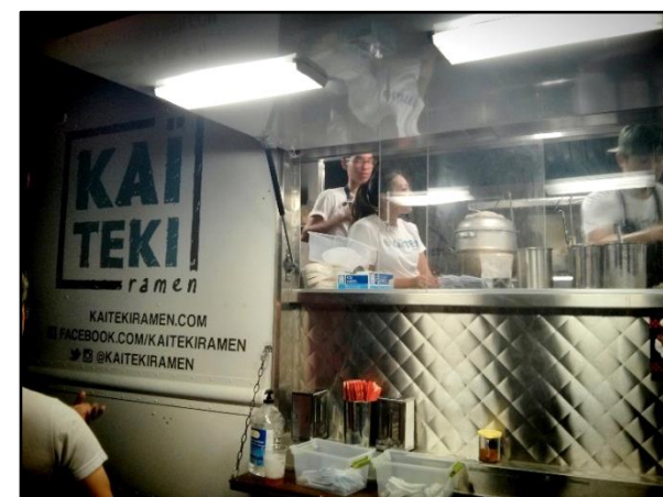
Packed Galley Kitchen